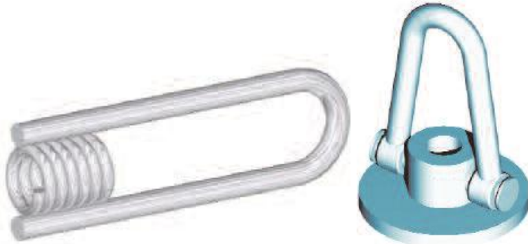
(2172) CX-4 COIL LOOP INSERT - FLARED

Meadow Burke hoist rings meet/exceed ASME B30.26 requirements. Meadow Burke concrete coil loop lifting inserts shown below are not designed to comply with this standard.