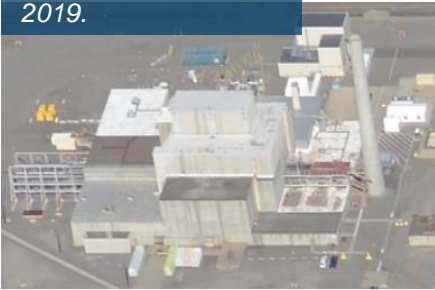
K West Reactor and support structures, 2019.