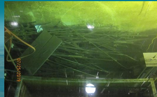
Underwater debris awaiting removal from K West fuel storage basin.