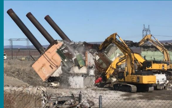
Demolition of 165 K West powerhouse