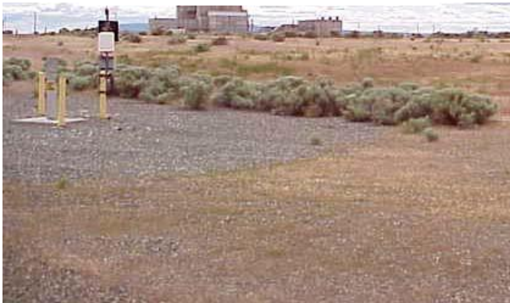
183-H Solar Evaporation Basins (2002)