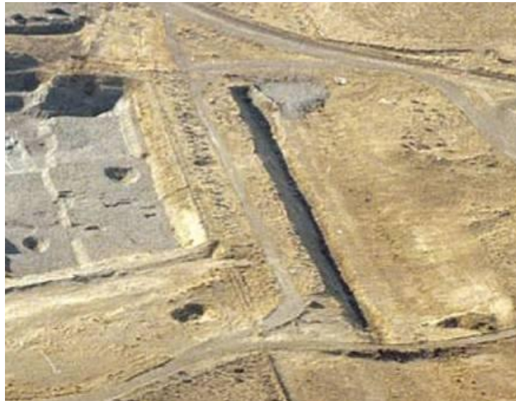
300 Area Process Trenches (2002)

Ecology previously did a State Environmental Policy Act (SEPA) determination of non-significance, dated Dec. 19, 1997, for each project.