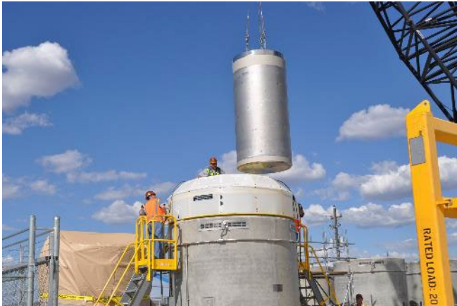
Move radioactive capsules from underwater storage in an aging facility to nearby dry storage