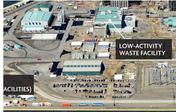
Start vitrifying low-activity waste