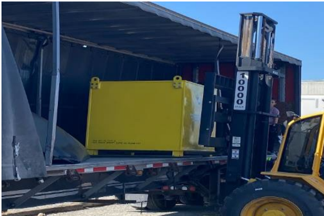
Shipping Test Bed Initiative liquid for off-site disposal: April 2025