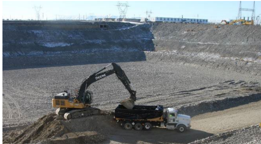
Loadout of contaminated soil