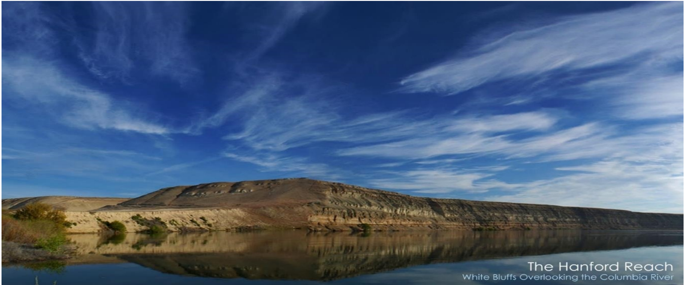
The Hanford Reach White Bluffs Overlooking the Columbia River