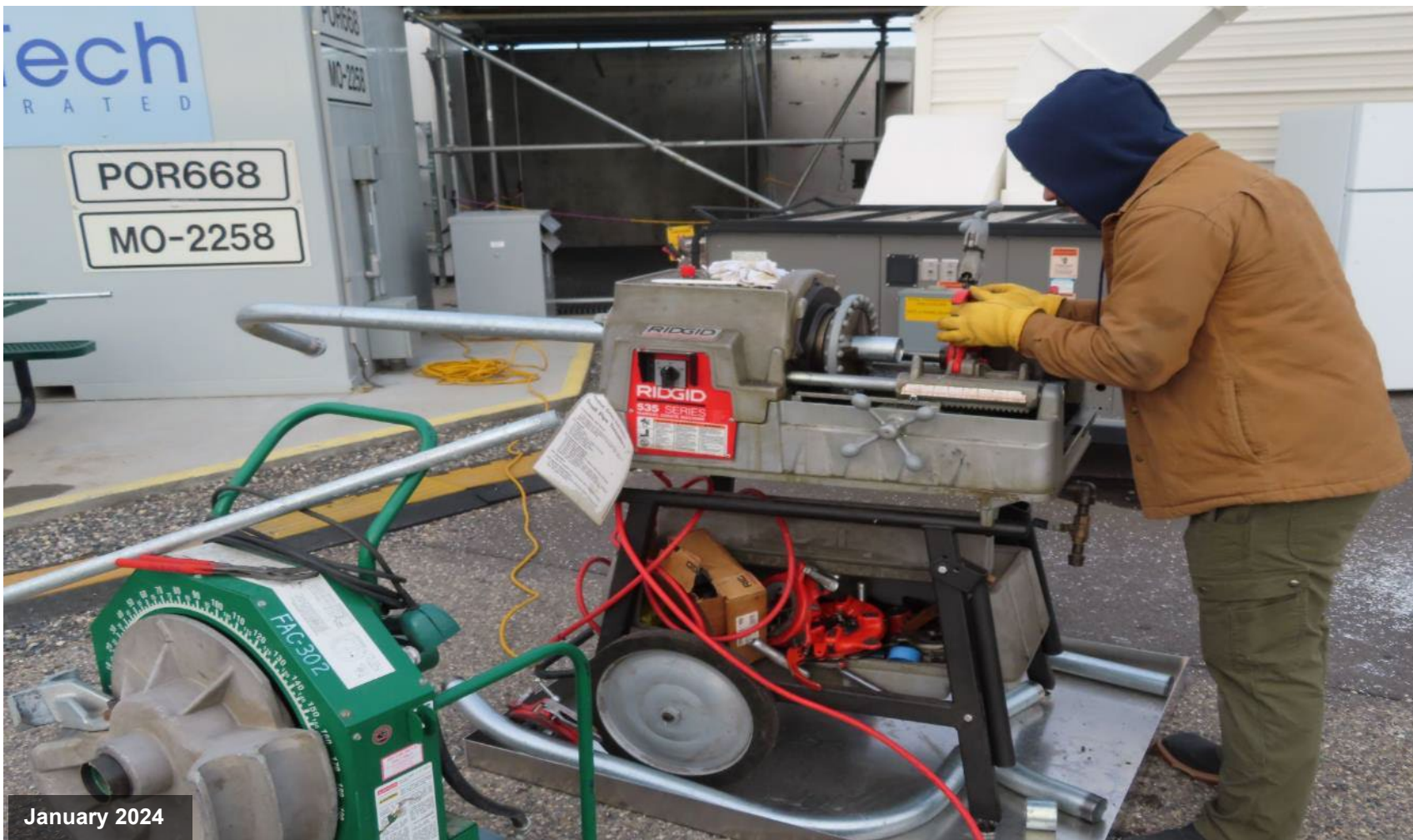
Following Tank-Side Cesium Removal System Campaign 1, workers are performing planned maintenance, including upgrading cameras inside the process enclosure.