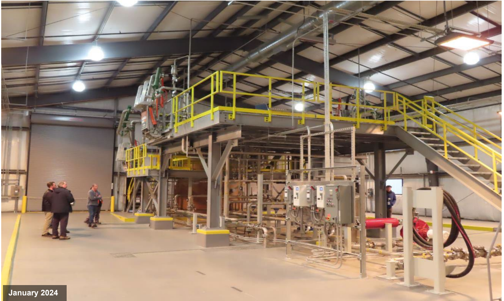
Washington State Department of Ecology inspection of the newly expanded load-in station at the Effluent Treatment Facility.