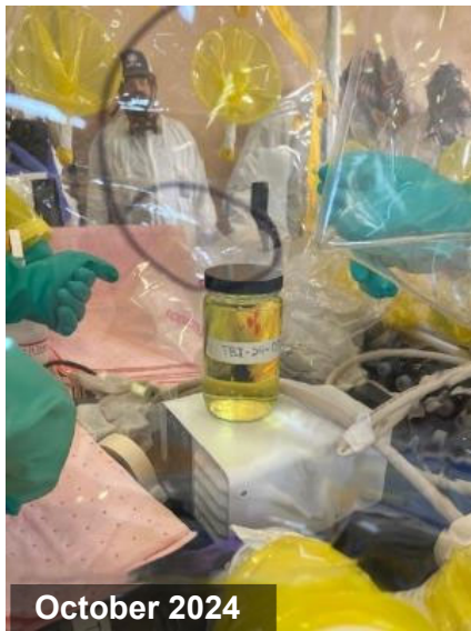
October 2024 Test Bed Initiative waste sampling