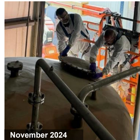
November 2024 Preoperational safety checks at the Effluent Treatment Facility