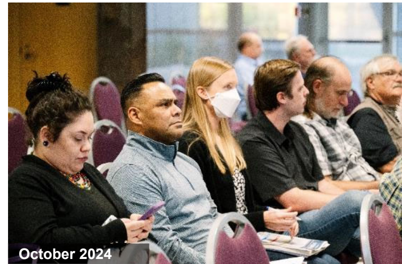
Hanford public meeting