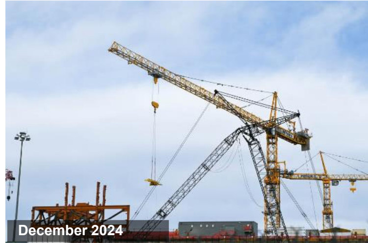
December 2024 Installing a bridge crane at the High-Level Waste Facility