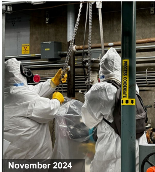
November 2024 Valve replacement at the 242-A Evaporator