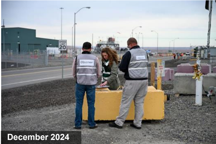
December 2024 Cold Commissioning Management Assessment