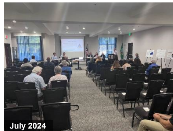
Public meetings on the holistic agreement were held in July in Richland, Olympia and Hood River