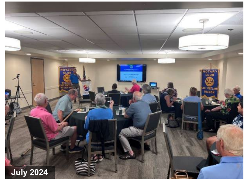
One Hanford presentation to the East Portland Rotary Club