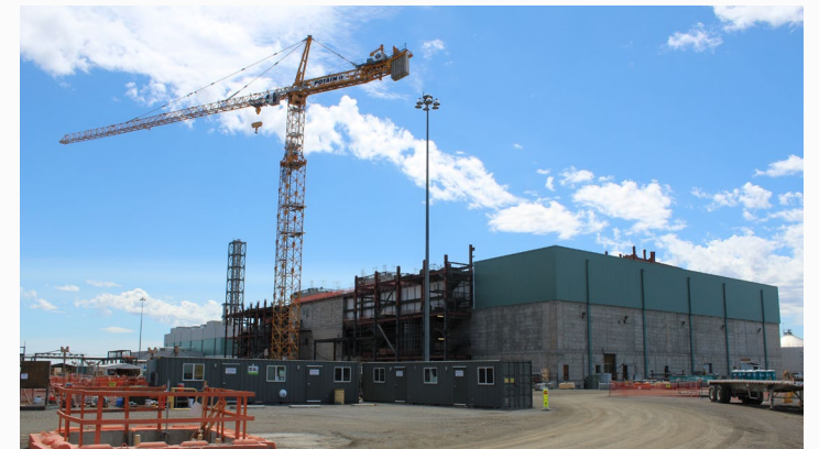
High-level waste facility in 2019. Following increased funding design and construction has recently resumed.

*Compliant budget refers to amount needed to meet Tri-Party Agreement cleanup milestones