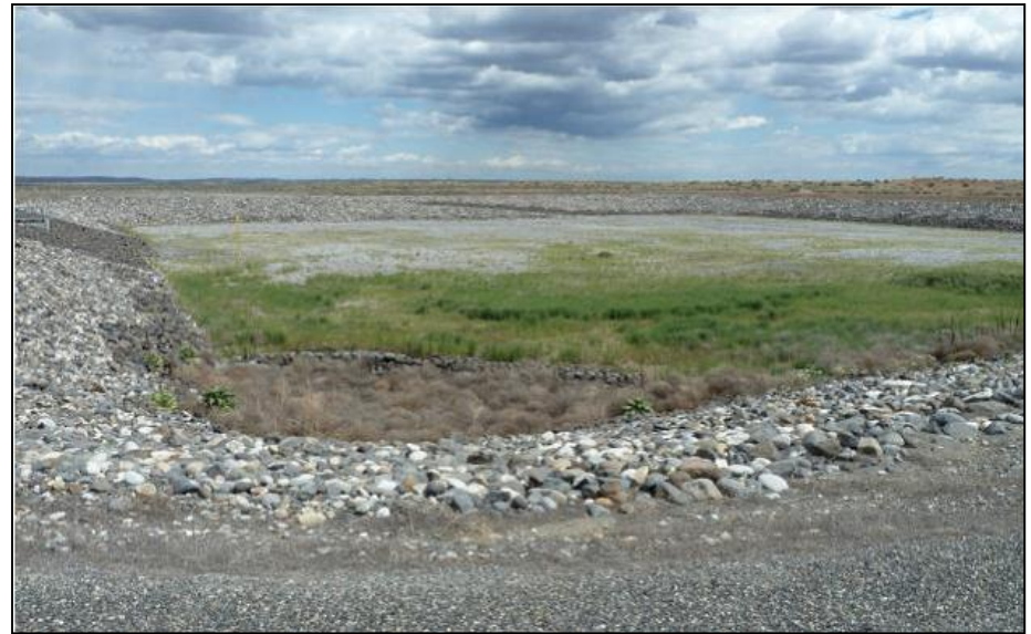
The Treated Effluent Disposal Facility "A" pond is one of two 5-acre infiltration ponds near the 200 East Area.