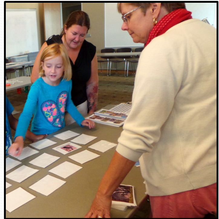
Ecology shared information about the animals of Hanford at the first annual Science Day at the Richland Library in July. More than 900 kids and parents attended.