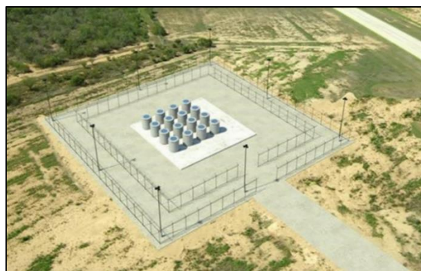
Conceptual Capsule Storage Area Illustration

Electronic access to the proposed permit modification and supporting documentation is available at the Administrative Record, 2440 Stevens Drive, Richland, WA. The documentation is also available in the Public Information Repositories.