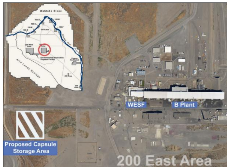
Proposed Capsule Storage Area Location