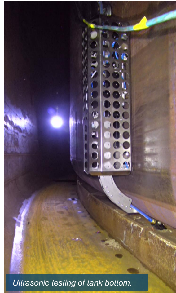
Ultrasonic testing of tank bottom.