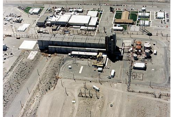
Aerial view of the REDOX Complex

This EE/CA evaluated alternatives for the removal action, based on effectiveness, implementability, and cost, and are summarized here by their primary actions: