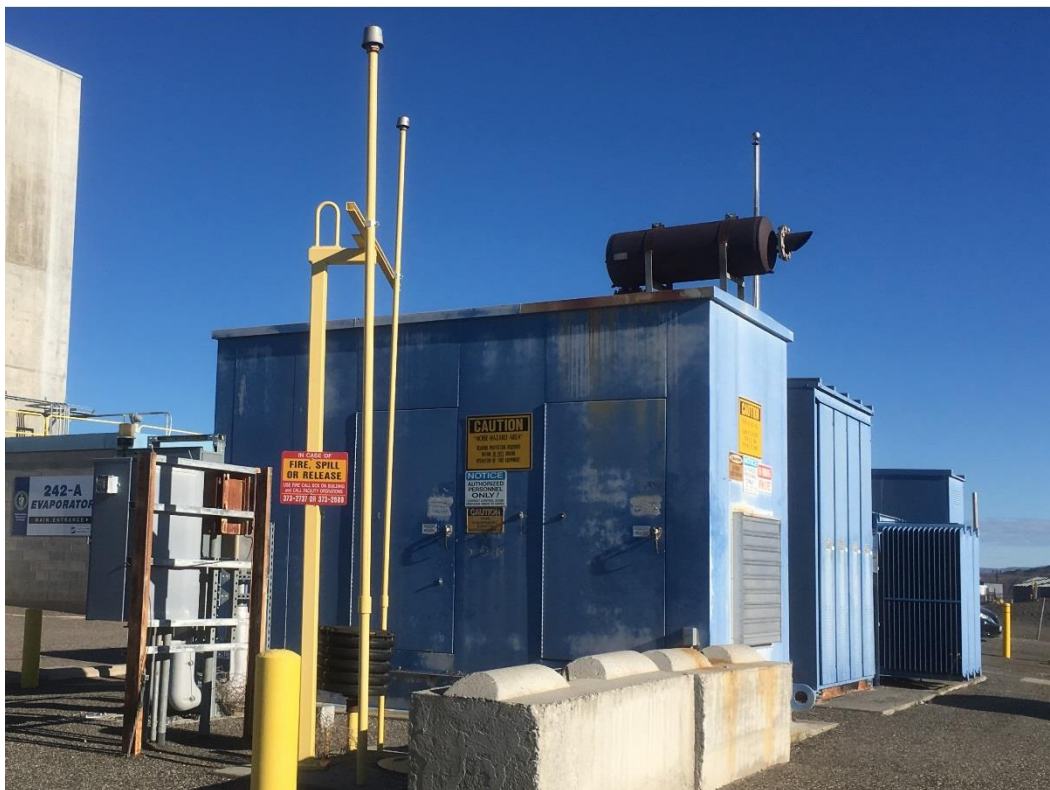
Diesel Generator Building