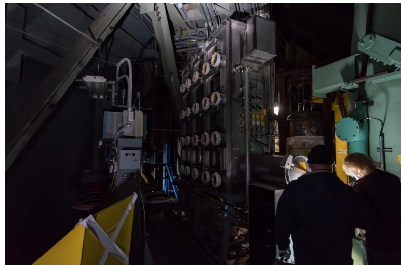
The Fast Flux Test Facility (left) in Hanford's 400 Area was shut down in 1993. Today, the primary activities include routine surveillance and maintenance (right) to ensure the buildings remain in a safe condition.