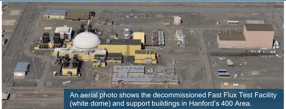
An aerial photo shows the decommissioned Fast Flux Test Facility (white dome) and support buildings in Hanford's 400 Area.

The U.S. Department of Energy (DOE) is holding a 30-day public comment period on an Engineering Evaluation / Cost Analysis (EE/CA) that evaluates alternatives for non-time-critical removal actions for nine structures in the Fast Flux Test Facility (FFTF) complex in Hanford's 400 Area.