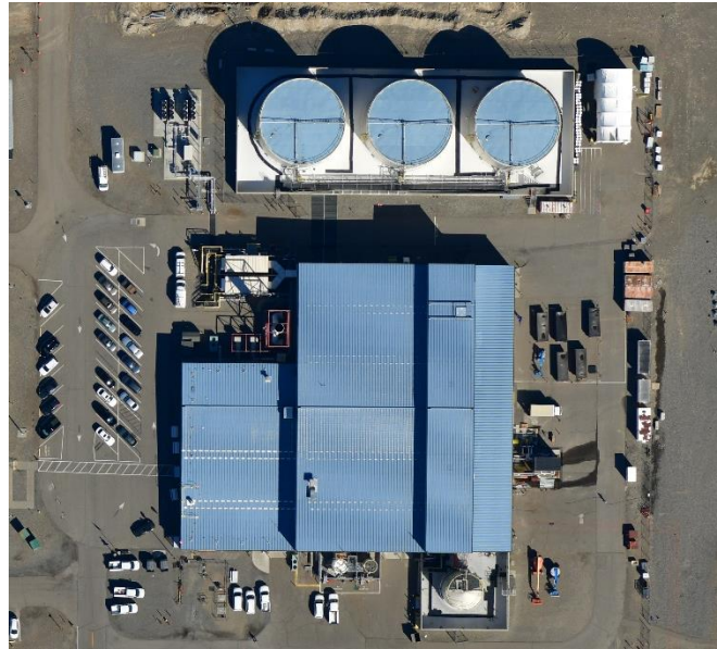
An aerial view of the Effluent Treatment Facility in the 200 East Area

Daina McFadden, Washington State Department of Ecology (509) 372-7950 Hanford@ecy.wa.gov