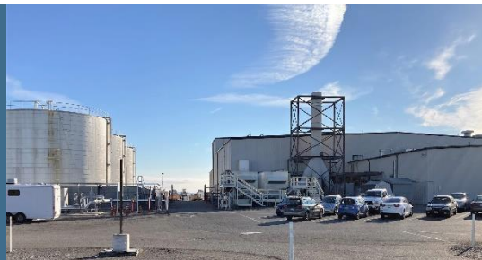
Outside the 200 East Area Effluent Treatment Facility