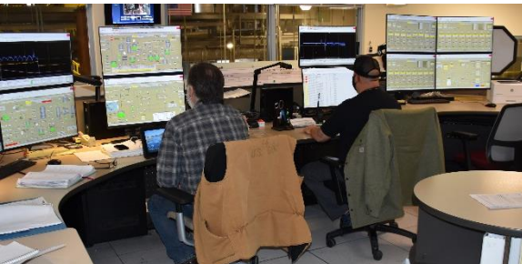
The Liquid Effluent Retention Facility and 200 East Area Effluent Treatment Facility are monitored closely by the operations staff in the control room