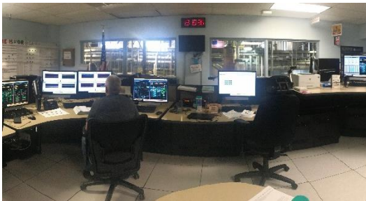
The Liquid Effluent Retention Facility and 200 Area Effluent Treatment Facility are monitored closely by the operations staff in the control room.