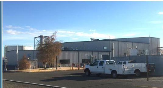
Outside the 200 Area Effluent Treatment Facility.