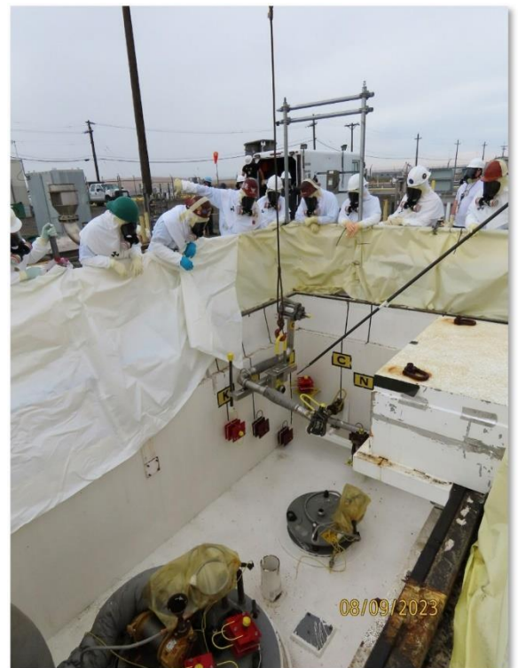
Workers installing waste transfer line

+1 (509) 600-2010 United States, Spokane +1 (833) 633-0875 United States (Toll-free) Phone Conference 595 516 379#