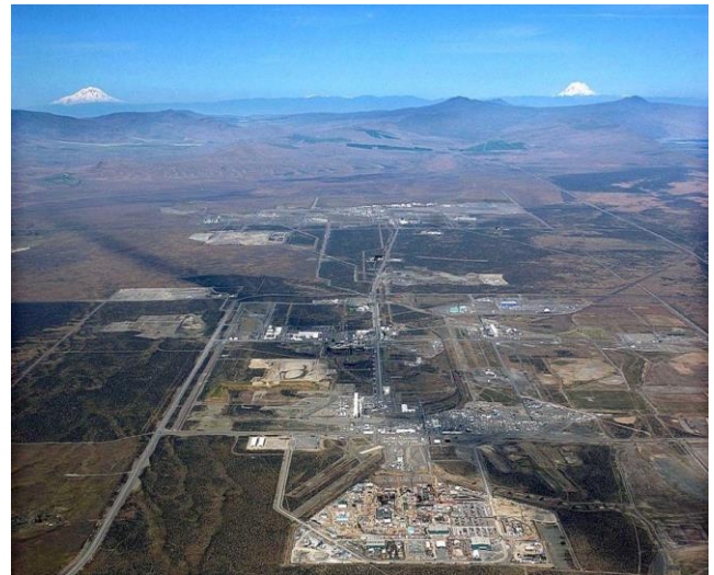
Aerial view of the 200 area of the Hanford Site