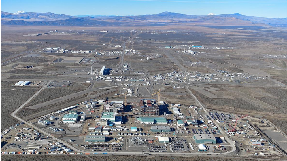
Aerial view of the Hanford Site's 200 East Area.