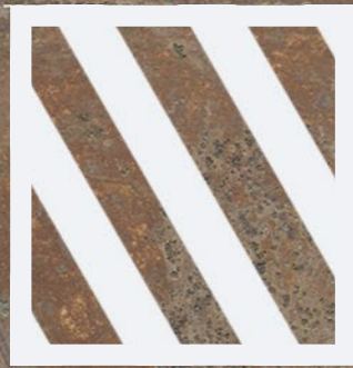
Proposed Capsule Storage Area