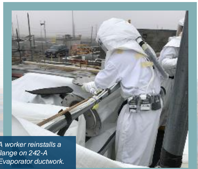
A worker reinstalls a flange on 242-A Evaporator ductwork.