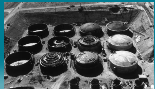
Hanford Tank Farms under construction.

The first SSTs were put into service in 1944 and were designed to be in use for about 20 years. In the 1950s, the SSTs began leaking waste into the surrounding soil. The SSTs were built with a carbon-steel liner surrounded by a layer of thick steel-reinforced concrete and buried 10 feet below ground. Currently, all SSTs are well past their design lives and no longer meet regulatory requirements. The waste has been stabilized by removing all free liquid, minimizing the chance of further leakage.