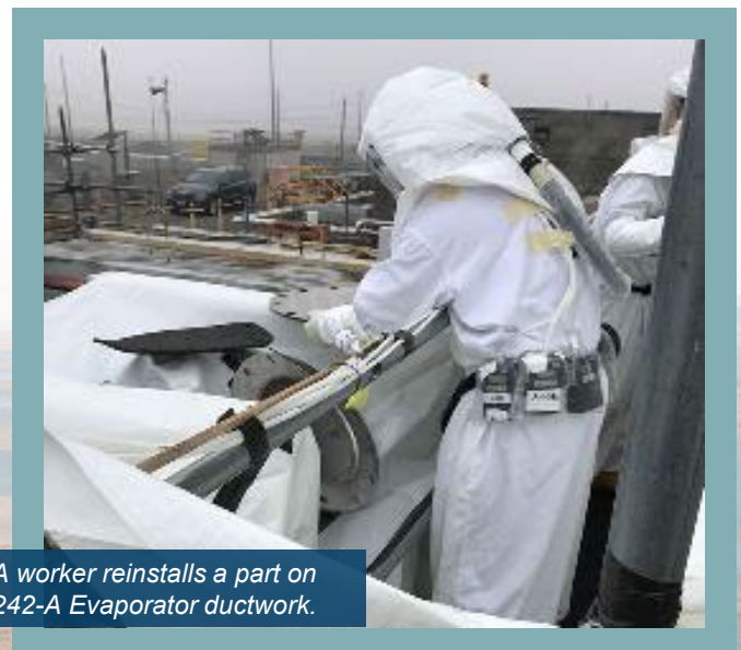
A worker reinstalls a part on 242-A Evaporator ductwork.