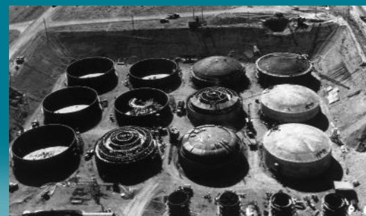
Tank Farms under construction.

The first SSTs were put into service in 1944 and were designed to be in use for about 20 years. They were built with a carbon-steel liner surrounded by a layer of thick, steel-reinforced concrete and buried 10 feet below the ground. All SSTs are now well past their design lives and no longer meet regulatory requirements. In the 1950s the SSTs began leaking waste into the surrounding soil. The waste in the tanks has now been stabilized by removing all free liquid from it, minimizing the chance of further leakage.