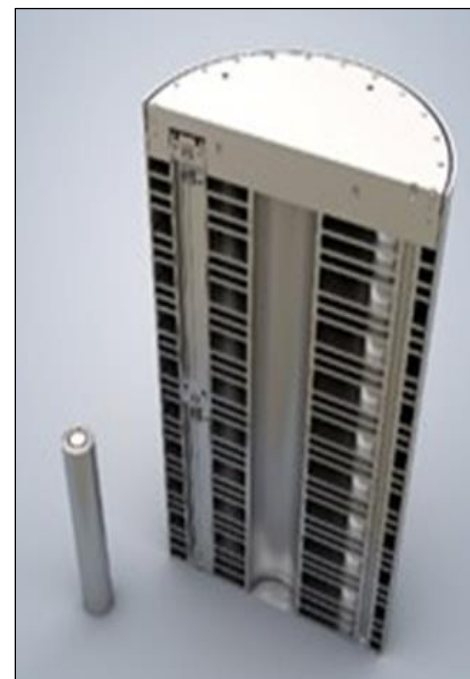
Example view of a cask container