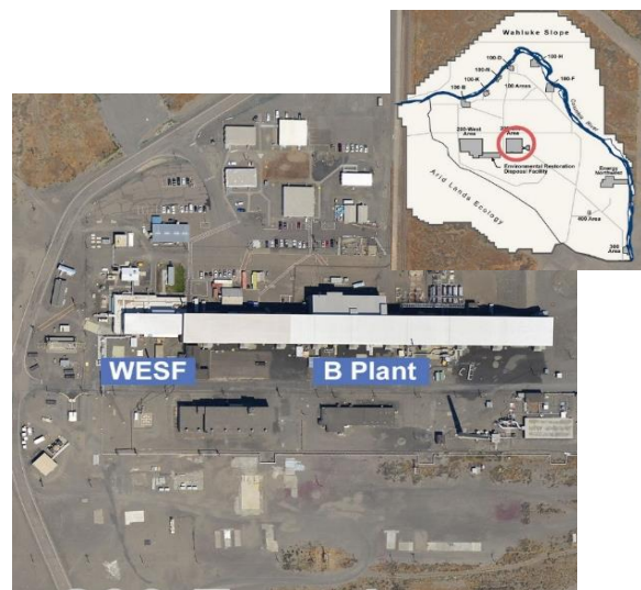
WESF is located in the 200 East Area

While the capsules are currently in a safe and compliant configuration, WESF is an aging facility. The possibility of a release of radioactive material from the WESF pool cells exists, should an unlikely event cause the loss of pool water. DOE-RL has proposed moving the capsules to dry, interim storage at a location to be called the Capsule Storage Area. The capsules cannot be transferred to interim dry storage until related modifications are made to the WESF.