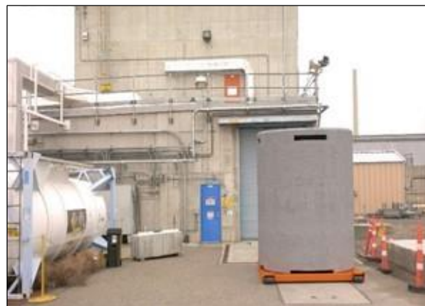
Cask model outside of Waste Encapsulation and Storage Facility (artist's rendering)

Electronic access to the proposed permit modification and supporting documentation is available at the Administrative Record, 2440 Stevens Drive, Richland, WA. The documentation is also available in the Public Information Repositories.