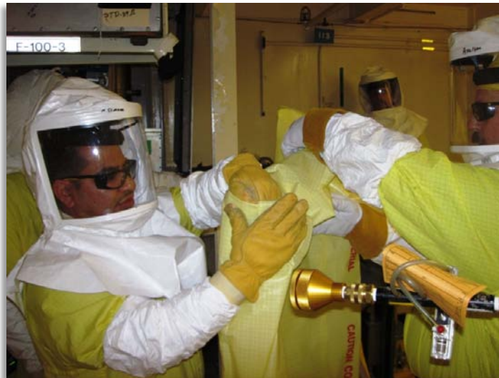
Packaging waste during removal of GB100A in Room 235E

December 2010 DOE/RL-2010-126-12, Rev. 0 Contract DE-AC06-08RL14788 Deliverable C.3.1.3.1 - 1