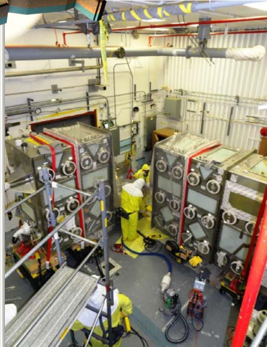
Separating Glovebox HC-230C-3 in Room 230C