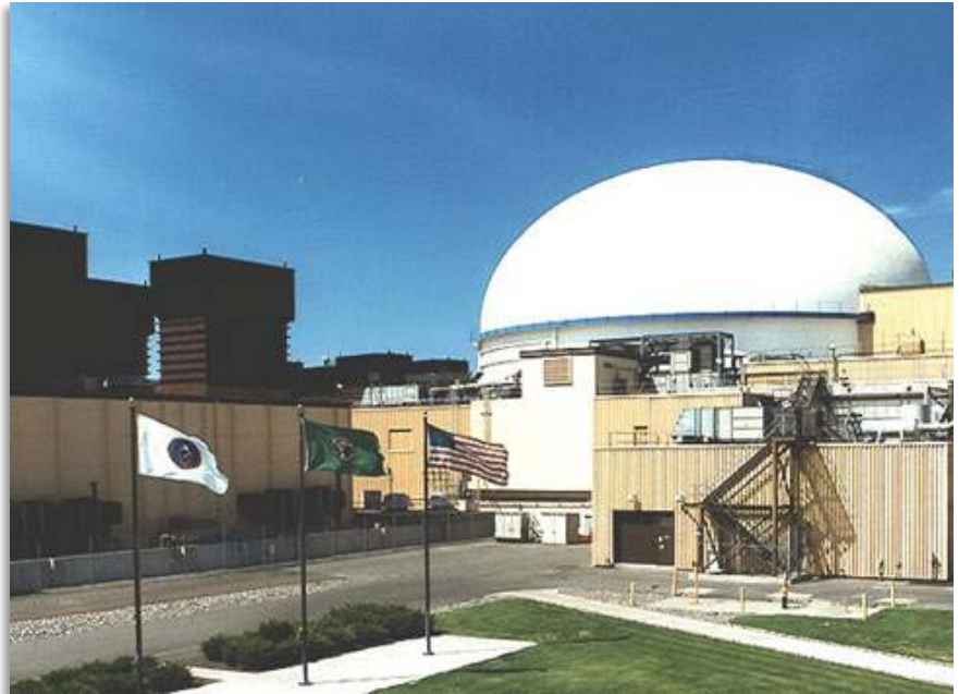
Fast Flux Test Facility